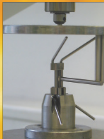
Torque Testing device