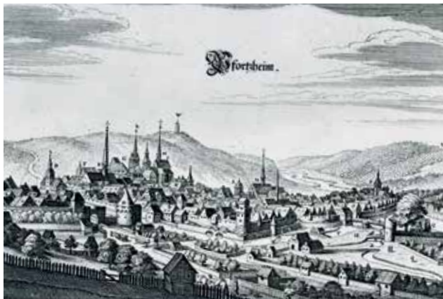
View of the orphanage (S5-005) Margrave Karls Friedrich von Baden (S1-28-001-017-R-015) Pforzheim by 1643 (S1-01-001-R-01-004)